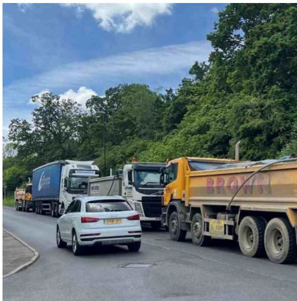
This is where South East Water has told tankers to now load water. It is the most crowded and unsafe truck stop area on Victoria. Hydrant is located at the far end.