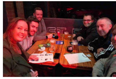
The PVL team were on good form, just one point separated them from the winners...