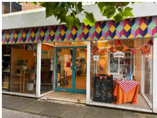
The BH Pantry's current location in The Martlets, now facing imminent closure

We need the support of you in the business community. The redevelopment of Burgess Hill town centre is long awaited and welcome, however it will result in the Pantry having to relocate to new premises or close its doors. We are calling on you to help us URGENTLY. Our Business Partnership Programme is looking for 25 local businesses to pledge £1000 per year for 3 years to the Pantry.