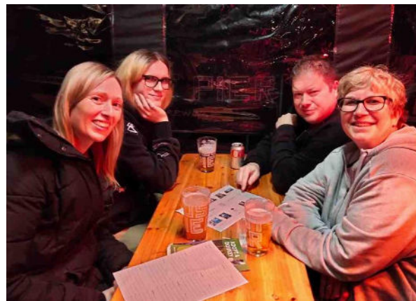
Winning smiles from the team

As winners the team walked away with a £100 Lost Pier Taproom bar token very generously donated by lostpier.com