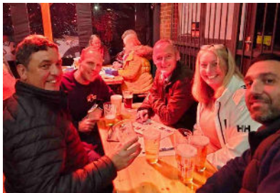
The team from Certa MPS seemed to be having a whale of a time