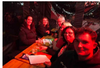
One of three teams that arrived from Nio COMM they were in great spirits